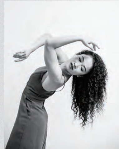
舞者(香港) Dancer (Hong Kong)