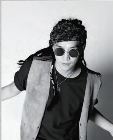
舞者(香港) Dancer (Hong Kong)